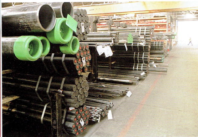
A wide variety of pipe sizes