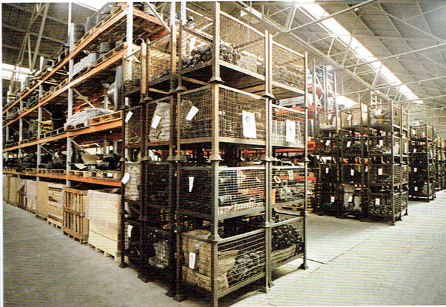
Fittings and Flanges of all sizes

In today's fast moving manufacturing industry where everything is required "yesterday" it is sometimes rather difficult to bridge the gap between the manufactur-